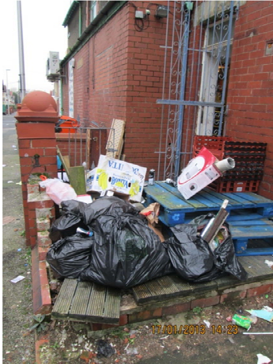
15) Accumulation of waste.