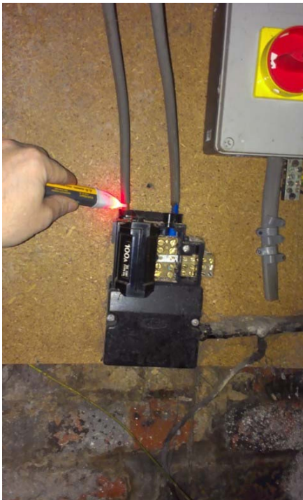
1) Above shows dangerous electrical installations.