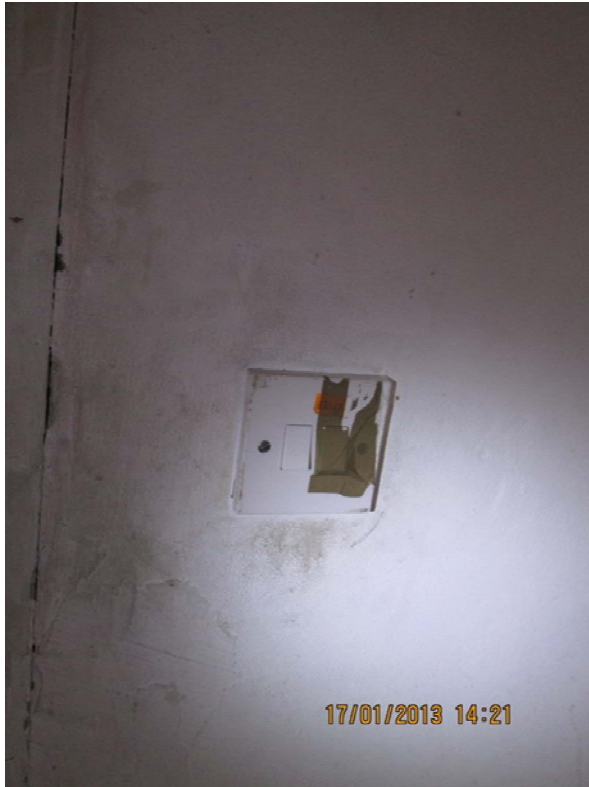
12) Broken light switch fixed with parcel tape.