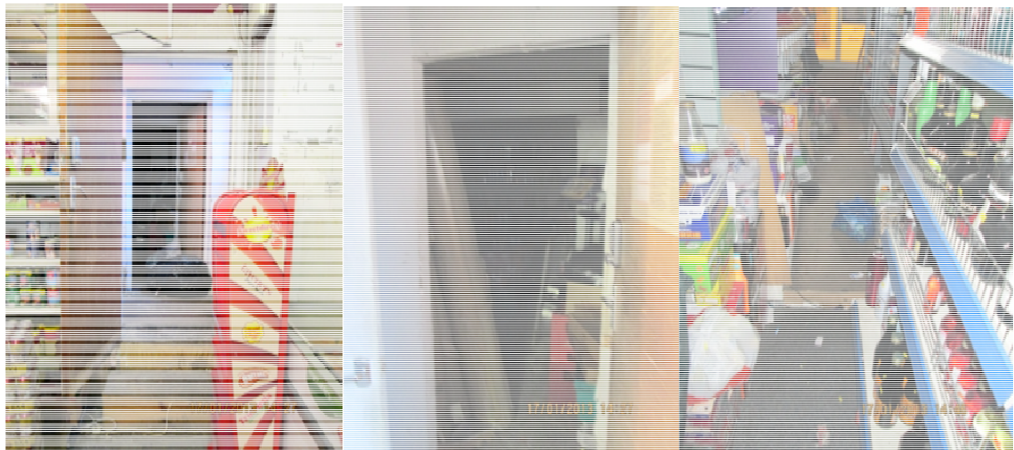
18) Cabling across walkways waste accumulation, unsealed wooden floors, wedged fire separation doors and further cluttered storage areas to the rear.