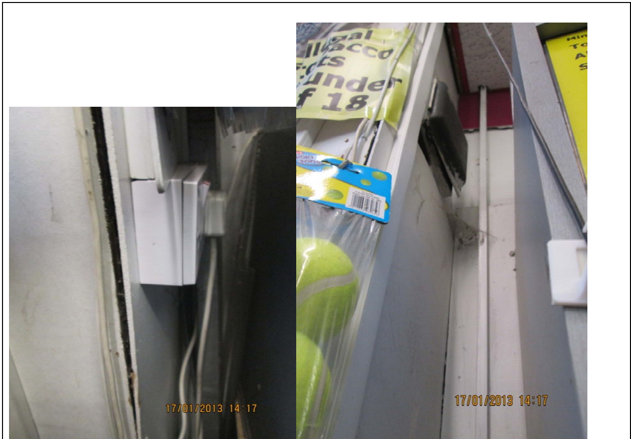
5) Damaged socket and an old electrical fuse box left open.