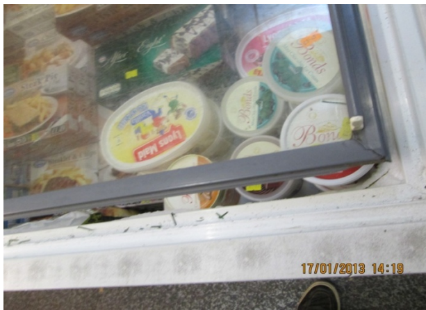
8) Broken freezer equipment.