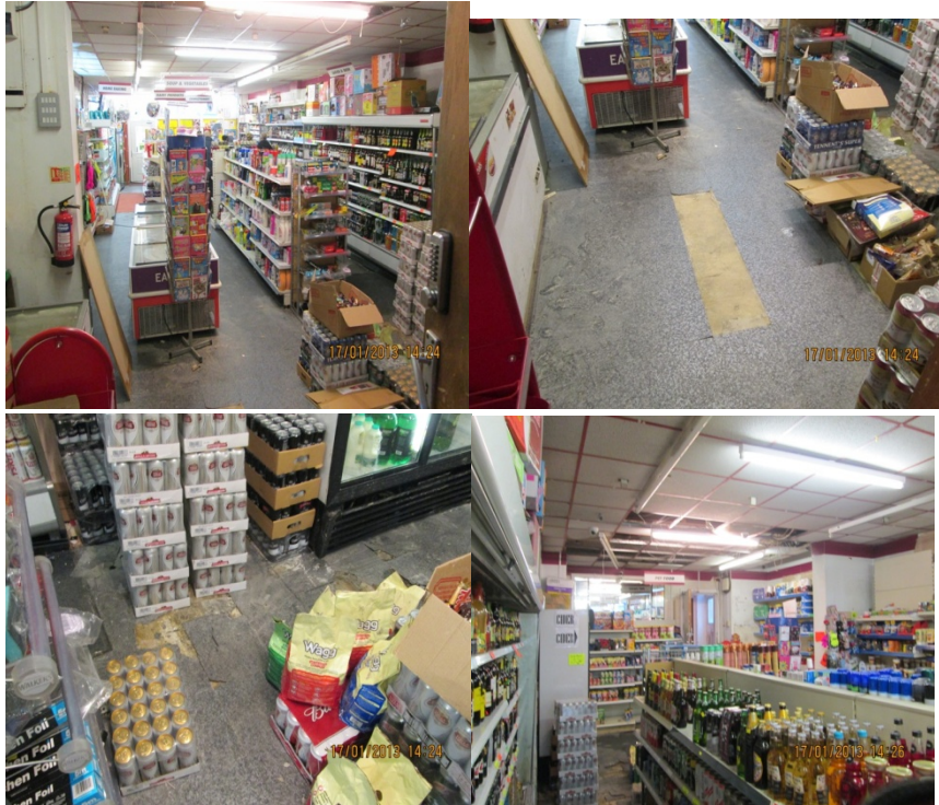
17) Further poorly maintained flooring, lighting and also cluttered shop area.