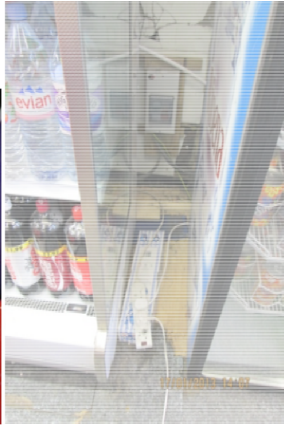
2) Cables trailing across walkways and under carpet and consumer units behind refrigeration.