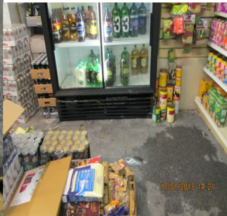
10) Flooded and very poorly maintained flooring areas.