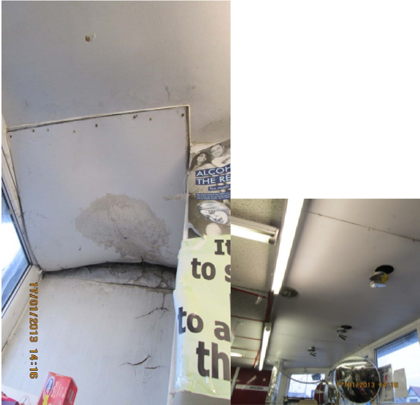
3) Damp ingress and extremely poorly maintained lighting and associated electrical systems.