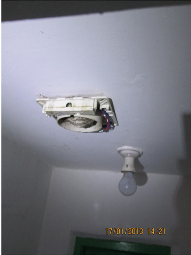
11) Damage ventilation fan exposing live electrical connections.