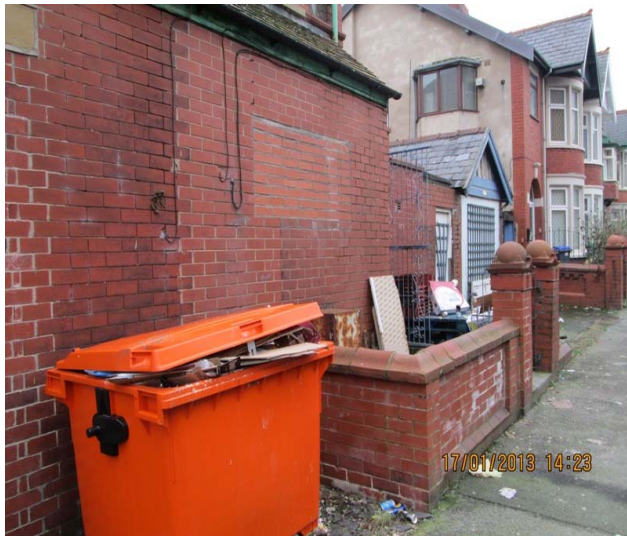
16) Clutter yard area and overflowing waste bin.