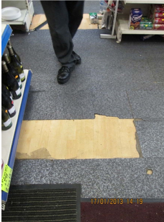
7) Poorly maintained floor areas.