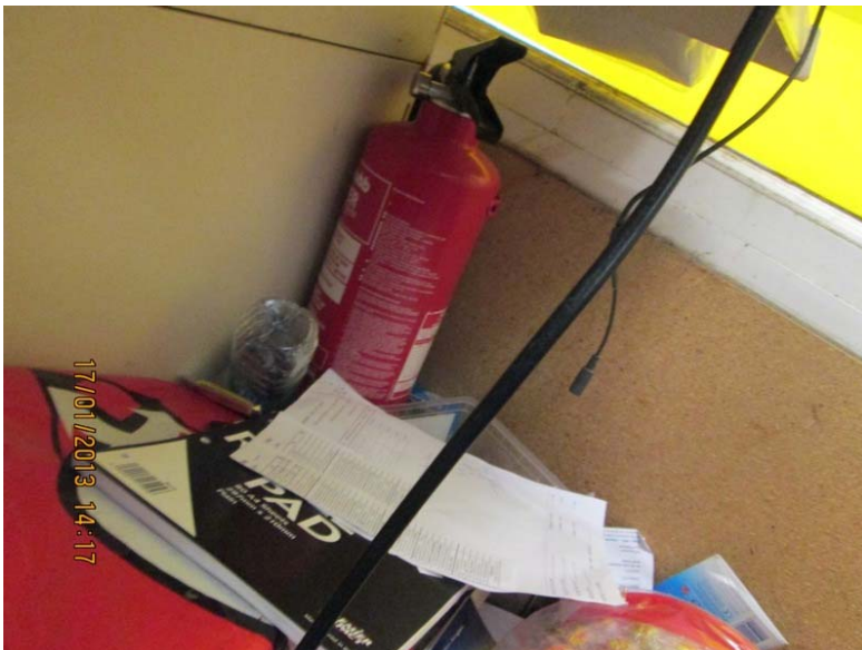
4) Obstructed fire equipment.