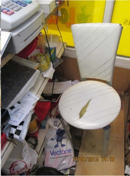
3) Cluttered work area and blocked cellar entrance.