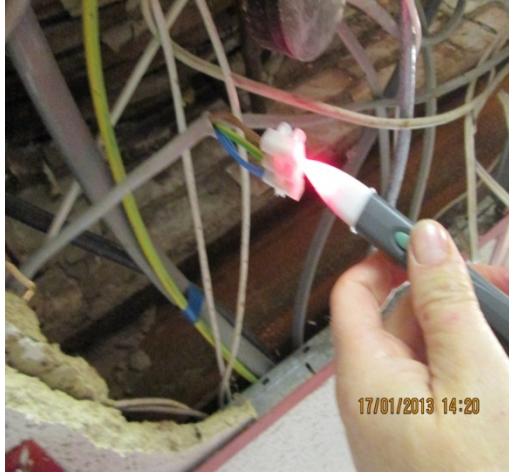
9) Collapsed ceiling exposing dangerous and poorly maintained electrical installations.